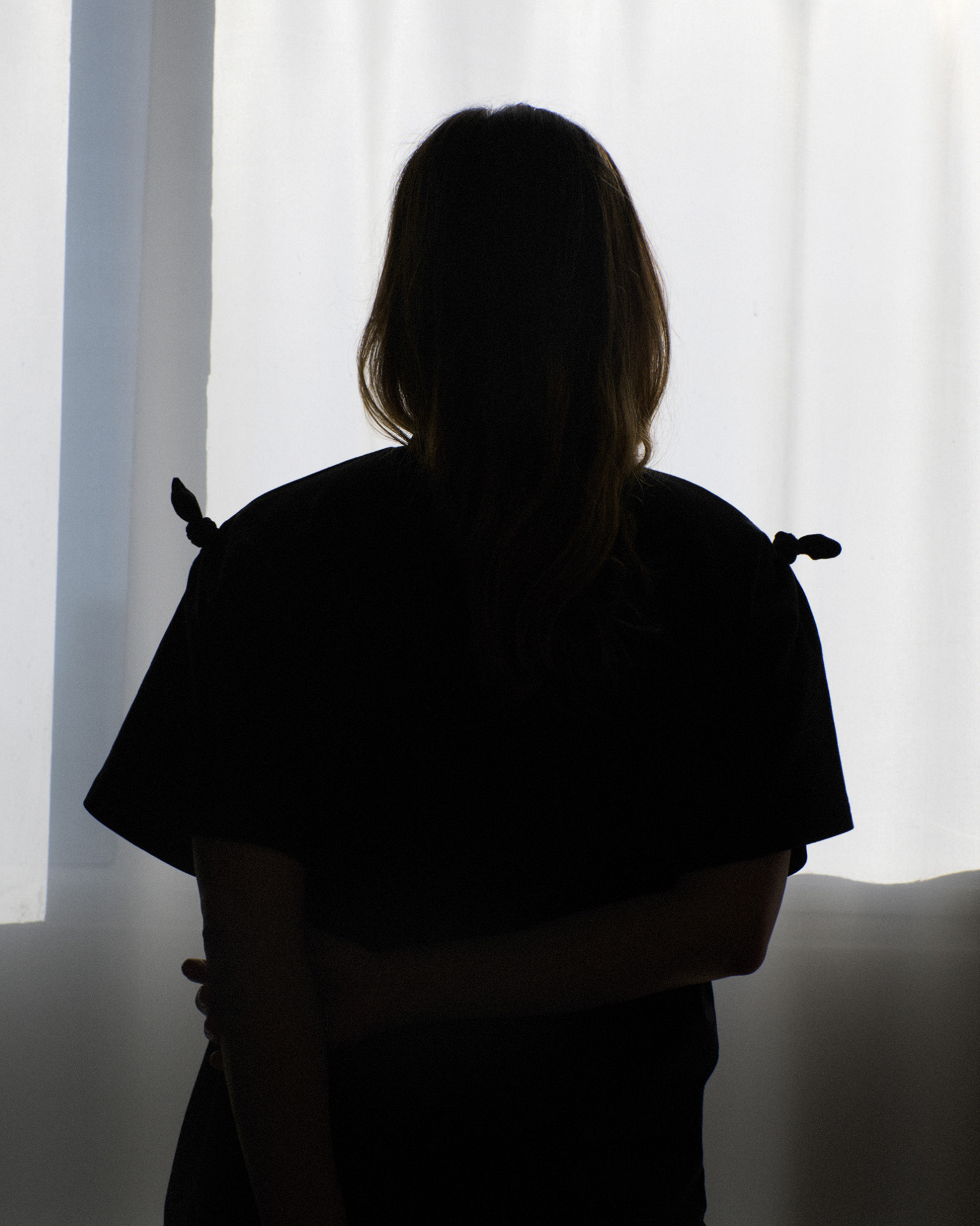
BLACKKNOTTED T-SHIRT in organic cotton, in sizes medium and large