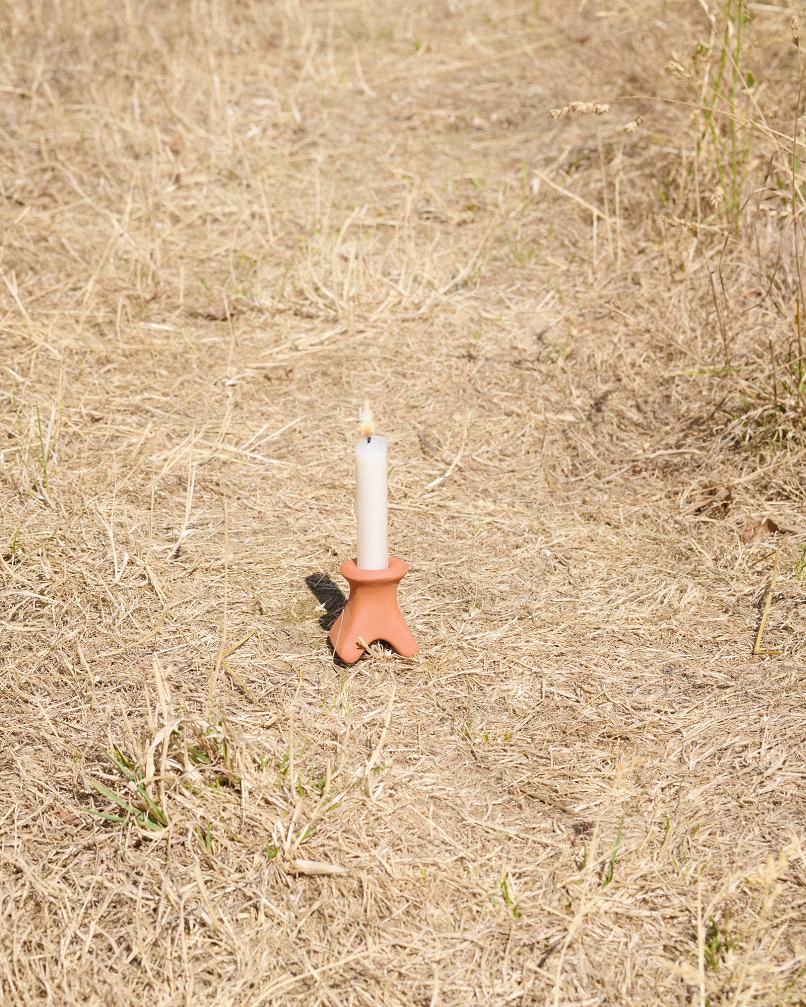
HANDHELD CANDLESTICK cast in terracotta