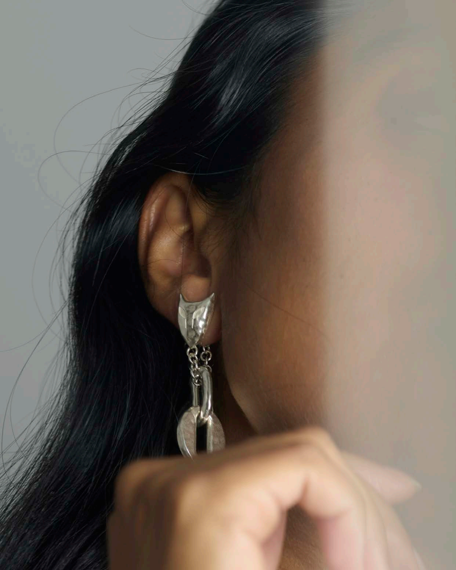
PARURE tumbled sterling silver chain links can be assembled into earrings, bracelets and necklaces