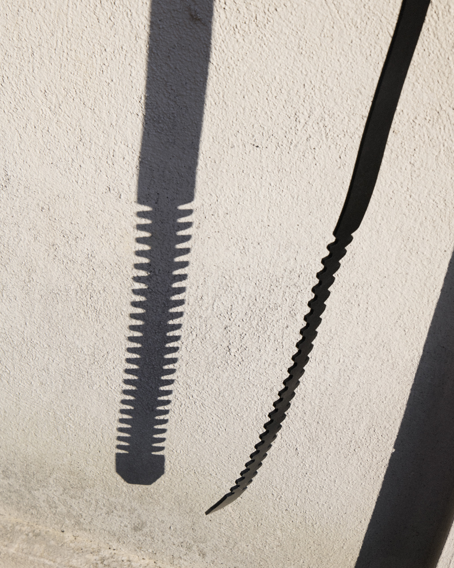
CROCODILE BELT cut out of vegetable tanned cow leather