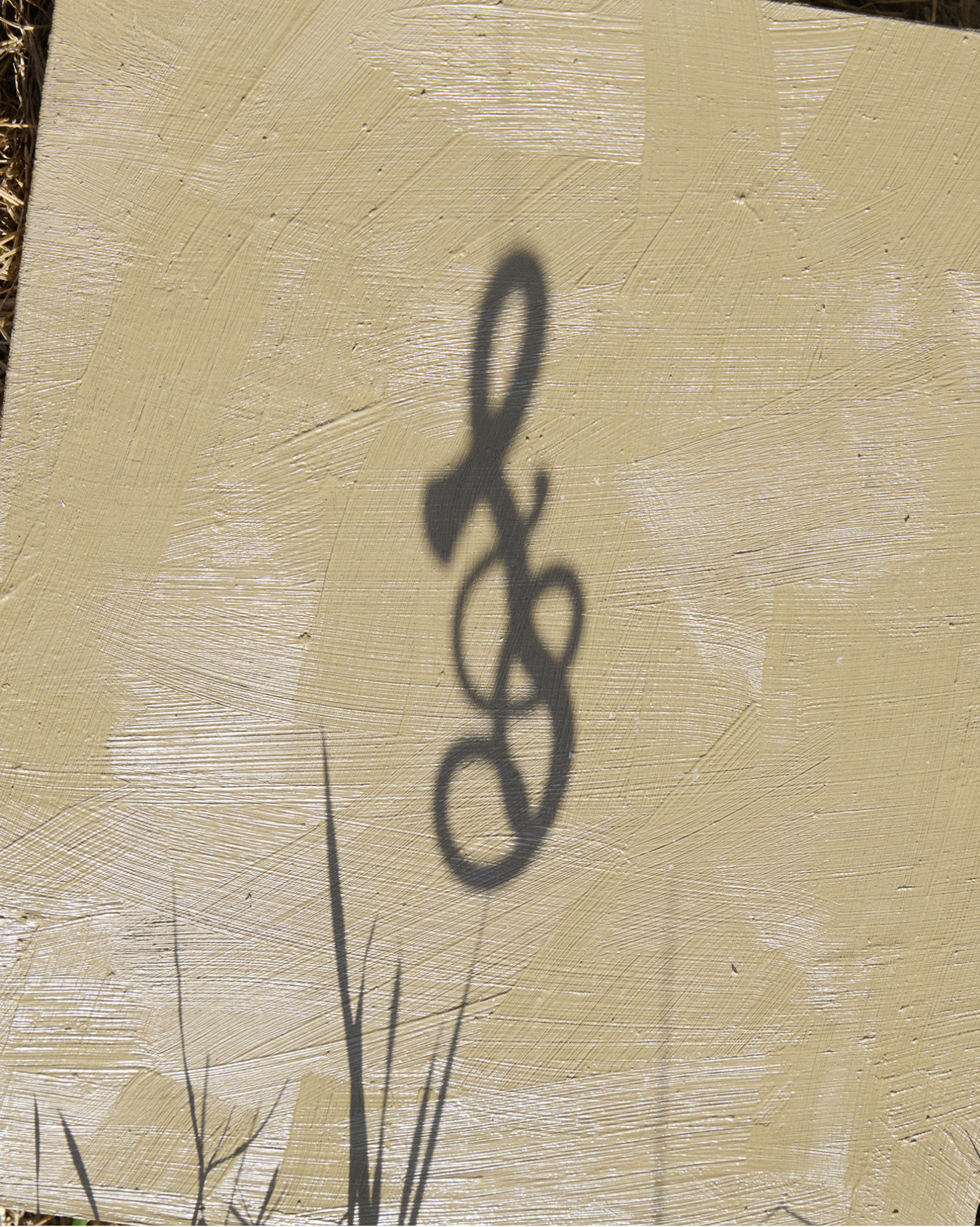
KEYHOOK you can loop your keys onto its sinuous shape made in sterling silver