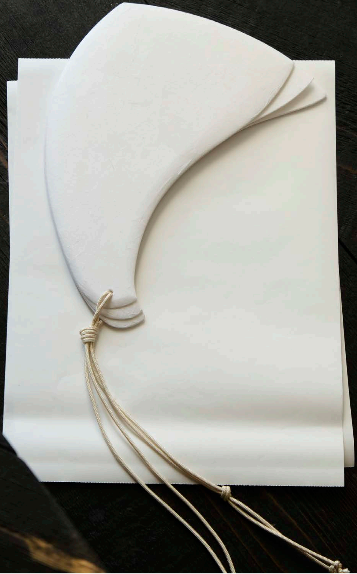
OPEN SOURCE FAN 3 downloadable leaves create a sliding fan