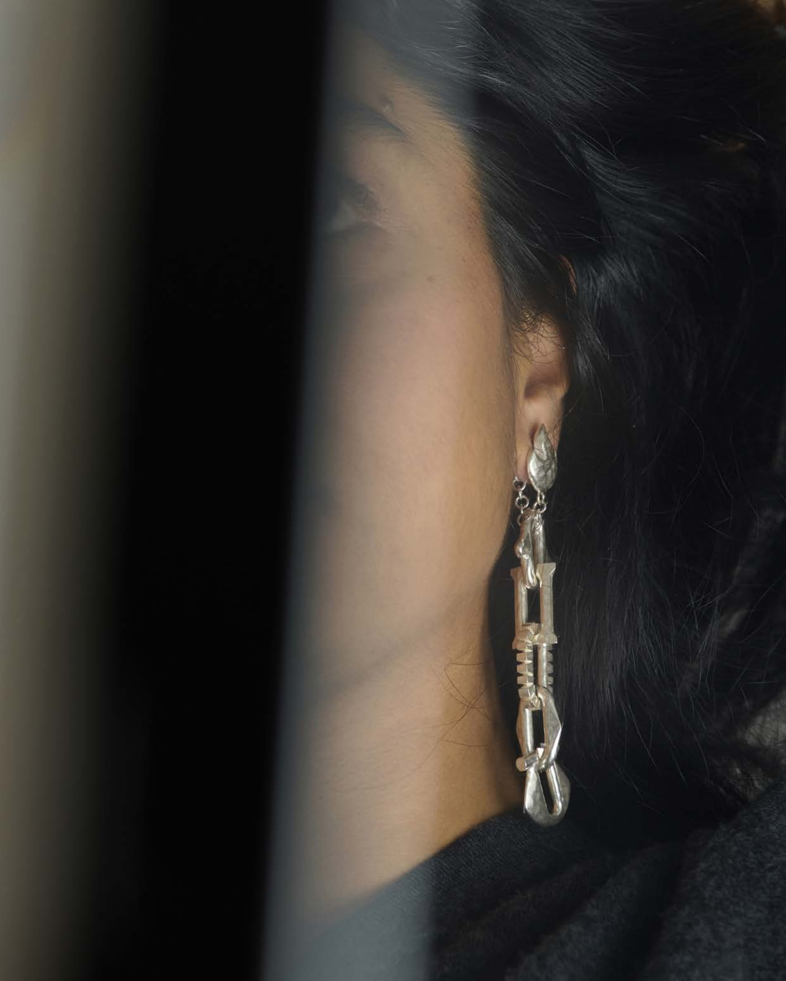
PARURE tumbled sterling silver chain links can be assembled into earrings, bracelets and necklaces