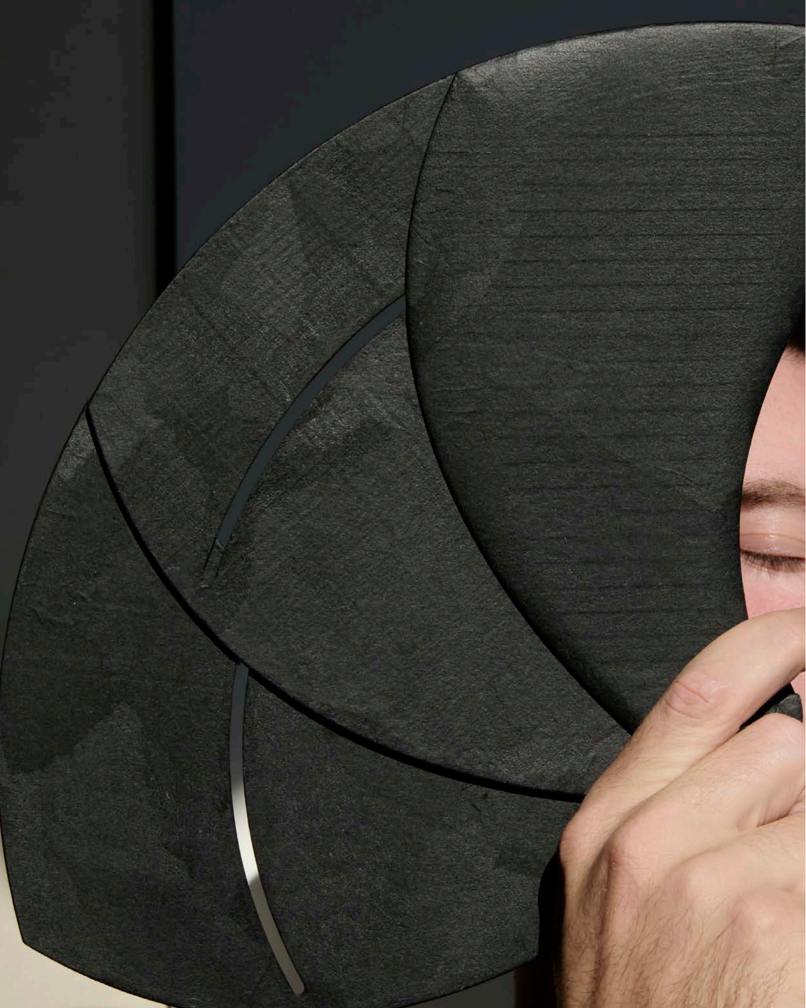
OPEN SOURCE FAN 3 downloadable leaves create a sliding fan