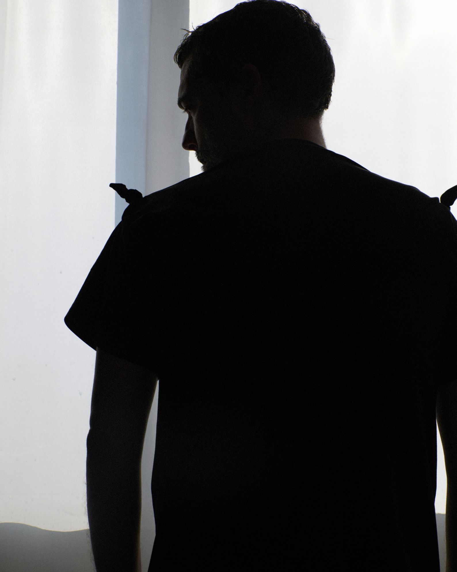
BLACKKNOTTED T-SHIRT in organic cotton, in sizes medium and large