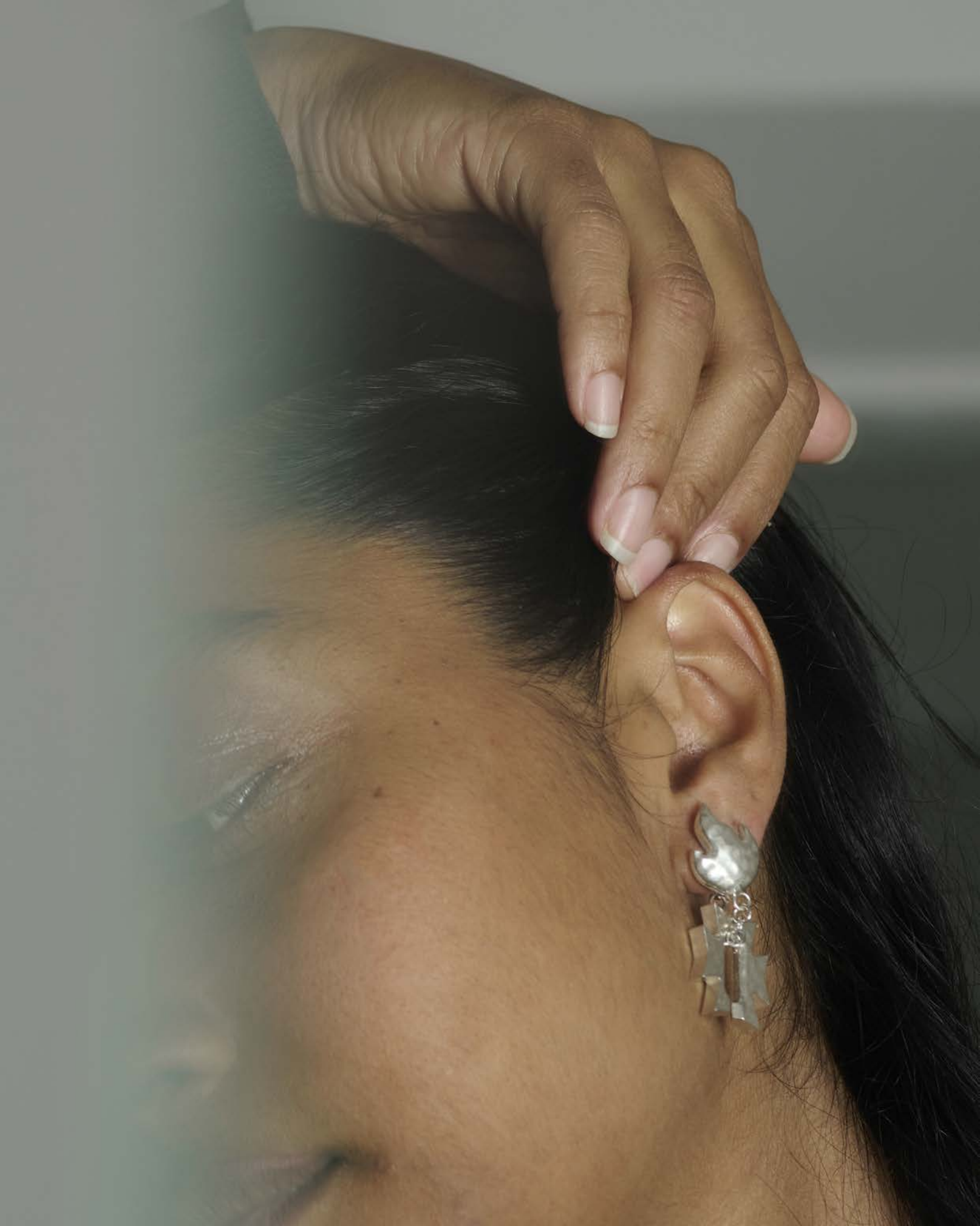
PARURE tumbled sterling silver chain links can be assembled into earrings, bracelets and necklaces