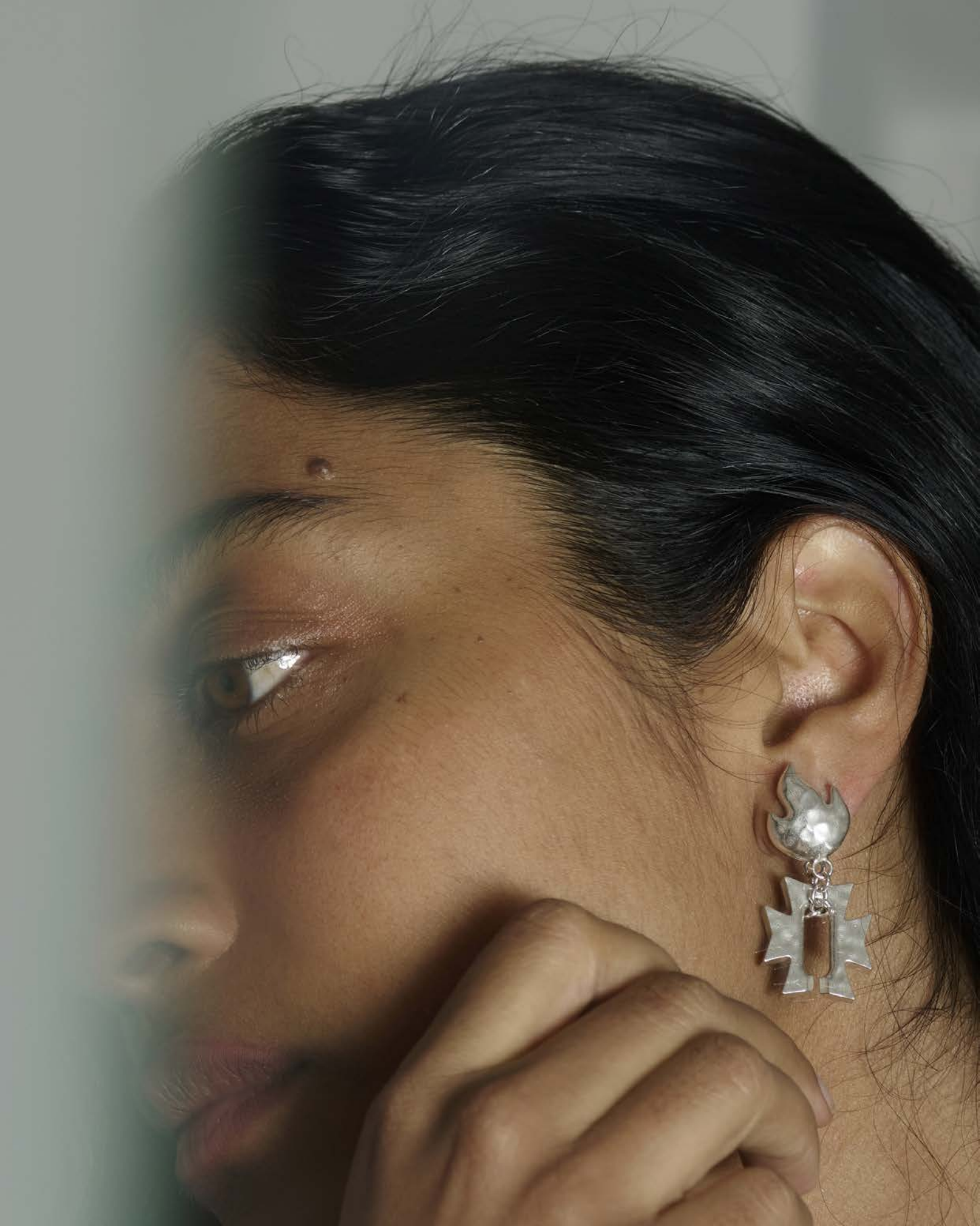
PARURE tumbled sterling silver chain links can be assembled into earrings, bracelets and necklaces