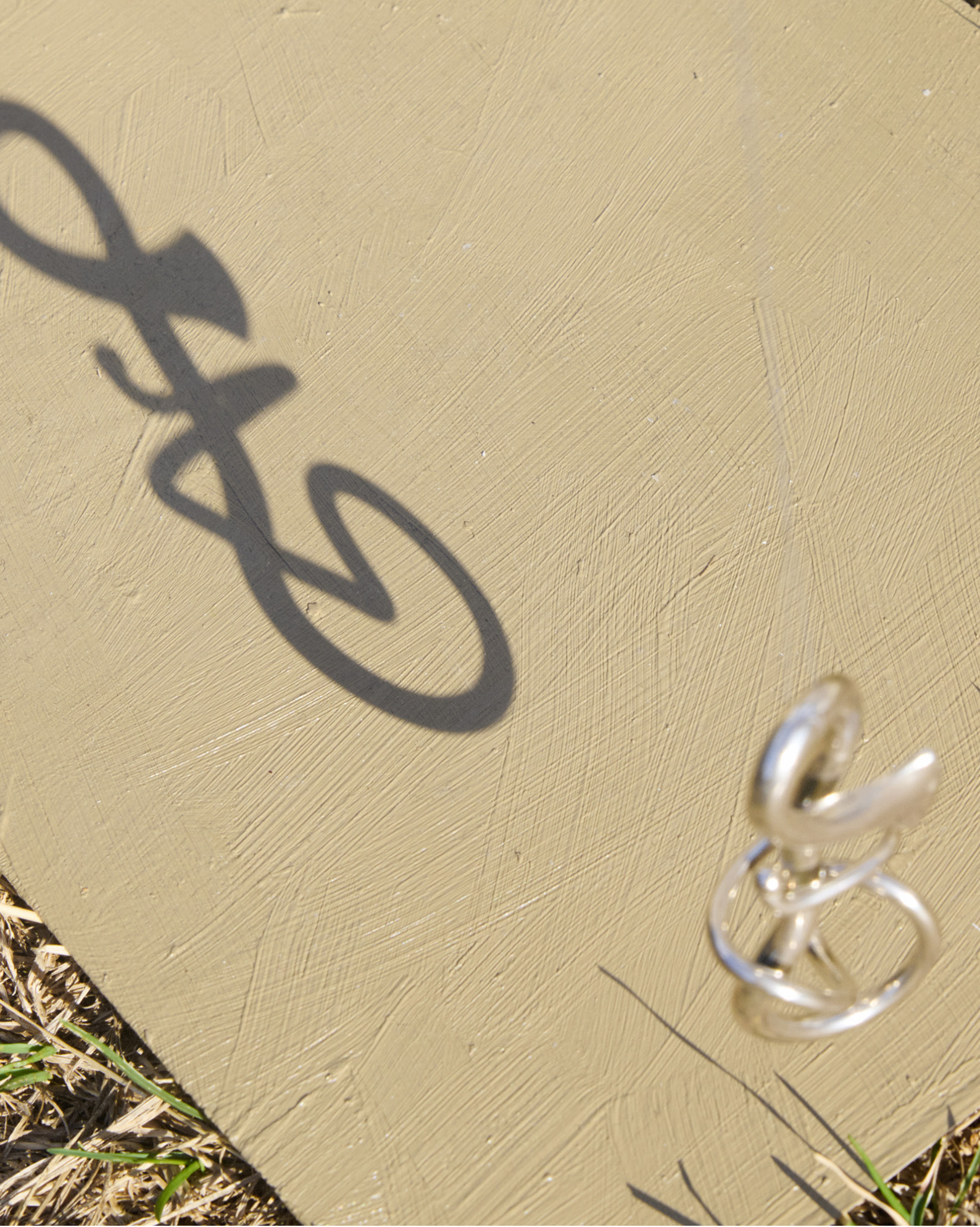
KEYHOOK you can loop your keys onto its sinuous shape made in sterling silver