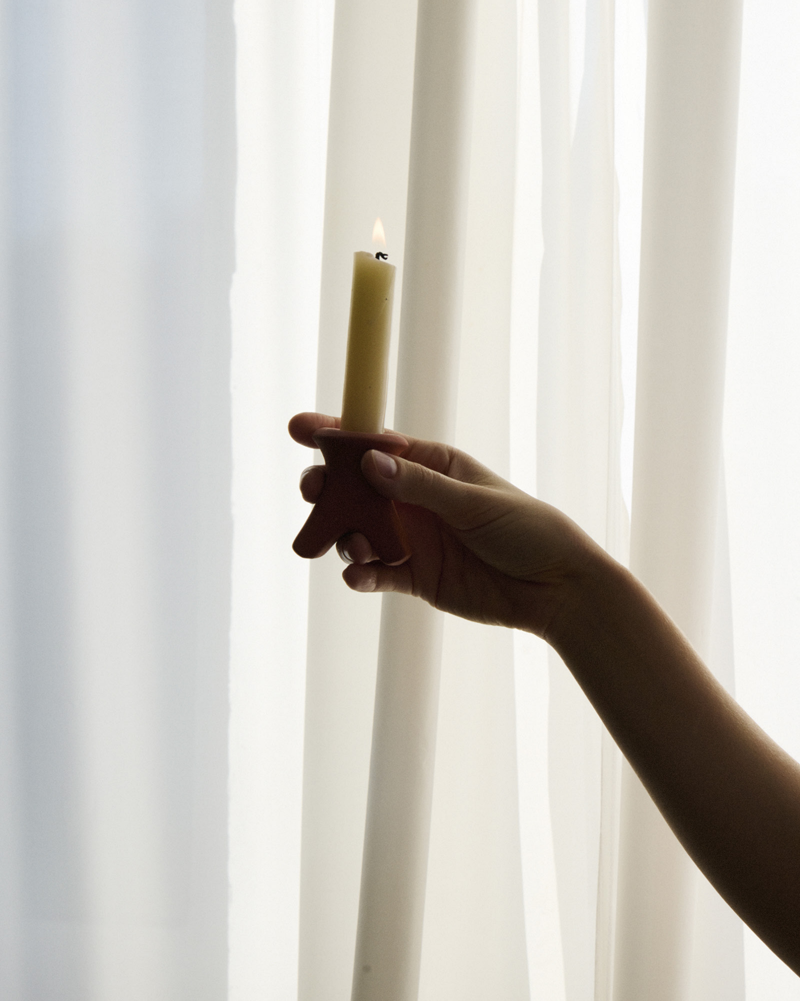
HANDHELD CANDLESTICK cast in terracotta